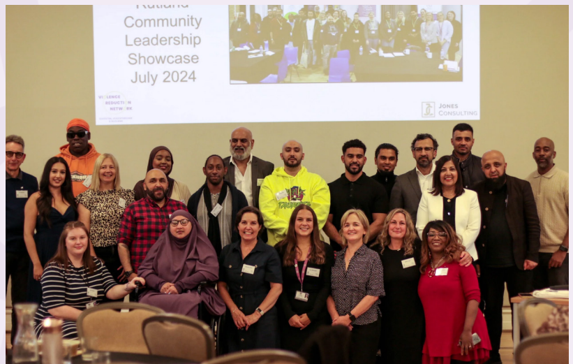
Community Leadership Programme Cohort 4 - 11th July 2024